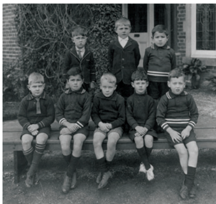
Preparatory class, 1923.