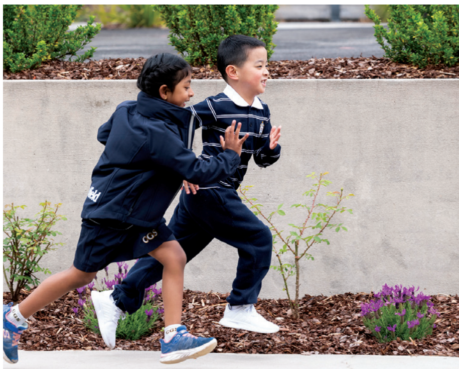
(Right and below) Our ELC students now have a uniform in keeping with School colours and style while still being functional and comfortable.