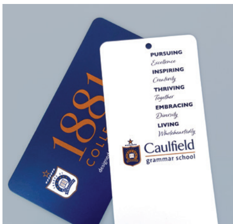
Tags on the new uniform serve as a reminder of the School Values.

Caulfield Grammar School students have been wearing our uniform with pride since 1881. With great excitement we now introduce the latest evolution of our academic uniform.