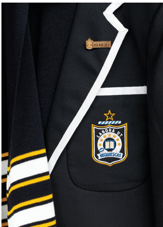
(Left and below) New accessories available include a cardigan, beanie and Year 12 specific items.