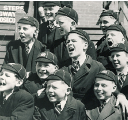
Students cheering at interschool swimming sports, 1950s. Wearing CGS caps with ties and jumpers showing distinctive stripe.