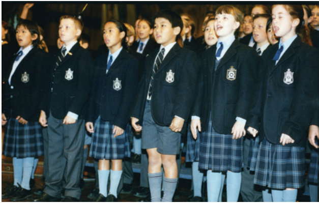
Primary Choir at Founder's Day service, 2003 – a snapshot of junior students wearing the winter uniform as was current until 2021.