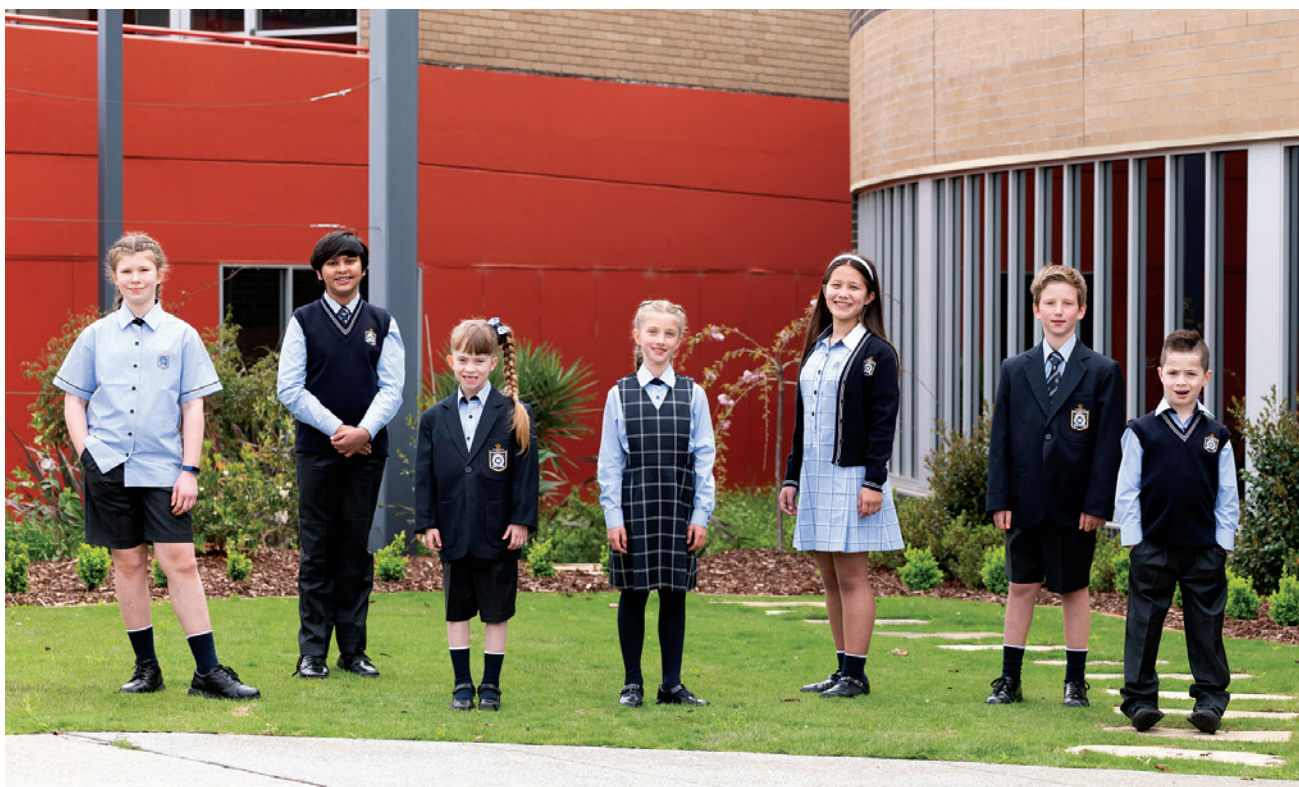
(Above and right) With the exception of the pinafore and skirt, students can wear the same uniform from Year 1 to Year 9, with the blazer introduced in Year 3.