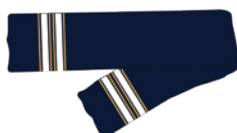
Scarf Year 12