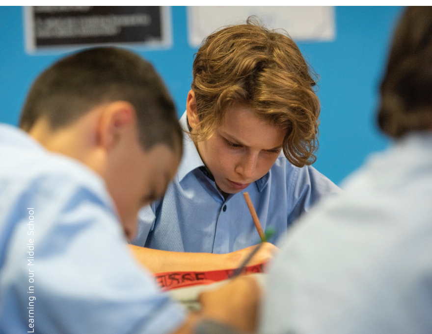
Learning in our Middle School

Values language as central to the development of critical thinking, which is essential for cultivating intercultural understanding and responsible membership in local, national and global communities. Language is integral to exploring and sustaining personal development and cultural identity, and provides an intellectual framework that supports the construction of conceptual understanding. All Middle School students undertake a compulsory language from Year 7 through to the end of Year 9.