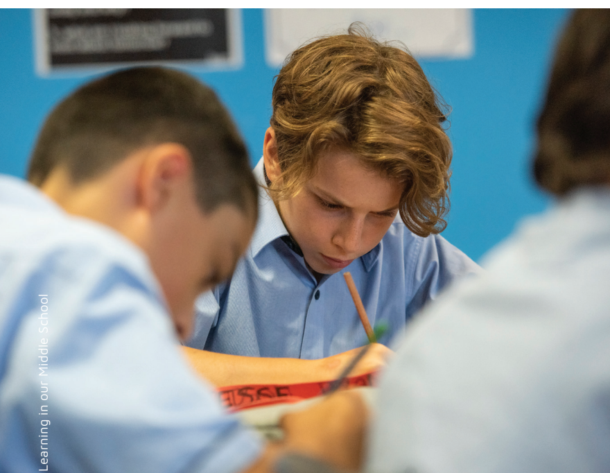
Learning in our Middle School

Values language as central to the development of critical thinking, which is essential for cultivating intercultural understanding and responsible membership in local, national and global communities. Language is integral to exploring and sustaining personal development and cultural identity, and provides an intellectual framework that supports the construction of conceptual understanding. All Middle School students undertake a compulsory language from Year 7 through to the end of Year 9.